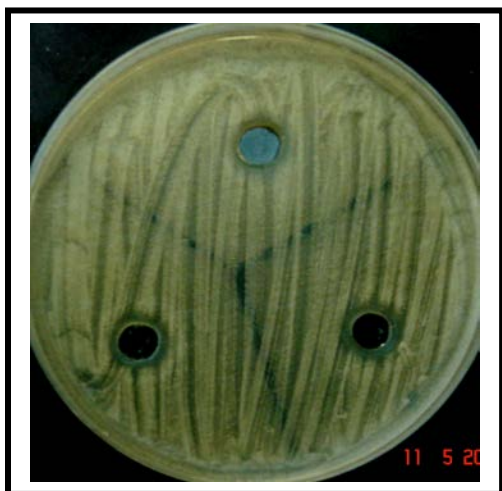
Plate 1(a): The inhibition of S. sanguis by 2 mg/ml dichloromethane extract of S. commune as measured by well diffusion assay

a good extracting solvent of antimicrobial compounds compared to the ethanol ( P < 0.05 ). The low activity of water extract may also be due to the effect of processing temperature on compound stability. The water extract was reported to be heat-labile (Hirasawa et al. , 1999). In the microbial analyses, it was observed that the water extracts of Lentinula edodes showed the lowest inhibitory activity against both Streptococcus mutans and Prevotella intermedia compared to the other extracts. The treatment of extracts at 60°C for 30 minutes reduced the antibacterial activity against the microorganisms by 60% and the activity was completely inactivated by heat treatment at 100°C for five minutes (Hirasawa et al. , 1999).